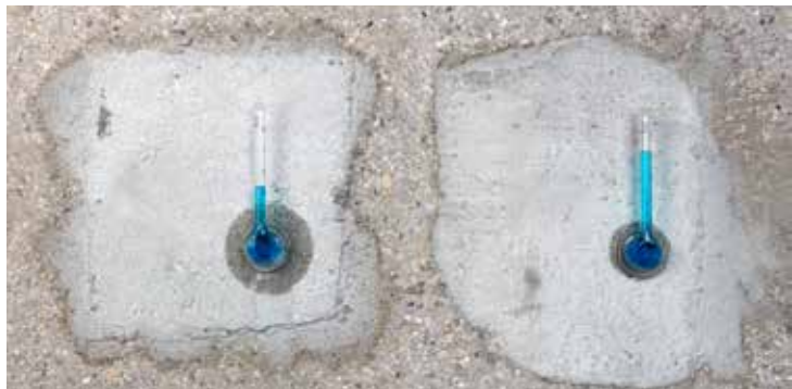
Mortar without SikaLatex® Mortar with SikaLatex®

SikaLatex® REDUCES WATER PERMEABILITY OF MORTARS: