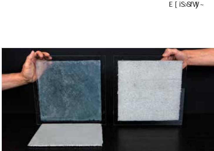
Mortar without SikaLatex® Mortar with SikaLatex®